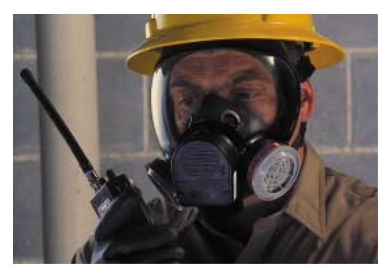
The Advantage 1000 Respirator is compatible with the ESP® Communications System for clear, ungarbled voice communications.

Some accessories available for use with the Advantage 1000 Respirator allow you to make an already impressive product even better.