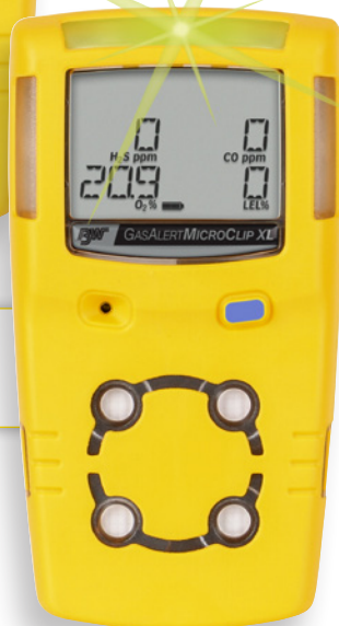
GasAlert MicroClip XL

NEW! GasAlertMicroClip Series now features IP68 for maximum water and dust protection.