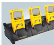
Five unit cradle charger

For a complete list of kits and accessories, please contact BW Technologies by Honeywell.