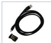
IR connectivity kit